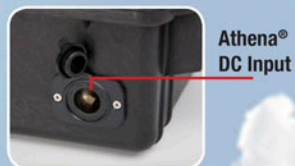
Athena® DC Input