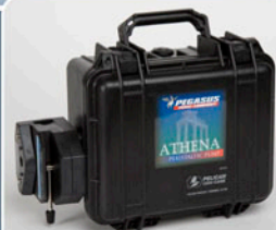
Athena® Pelican™ 1300 case