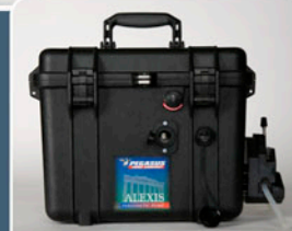
Alexis® Pelican™ 1430 case