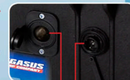
DC Input AC Input