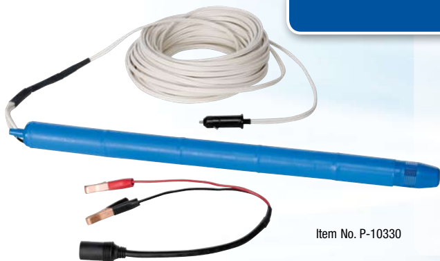
Item No. P-10330