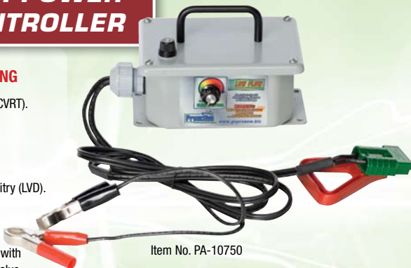
Item No. PA-10750