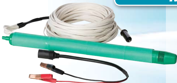
Item No. P-10300