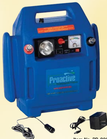
Item No. PB-20010

100% longer lasting than a standard 12 volt car battery.