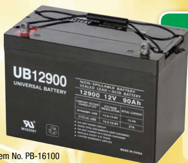
Item No. PB-16100

310% longer lasting than a standard 12 volt car battery