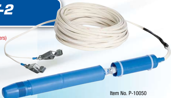
Item No. P-10050

NOT COMPATIBLE WITH ANY OF PROACTIVE'S CONTROLLERS.