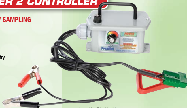
Item No. PA-10700