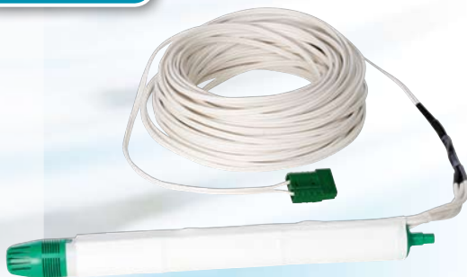
Item No. P-10400