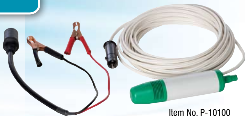
Item No. P-10100