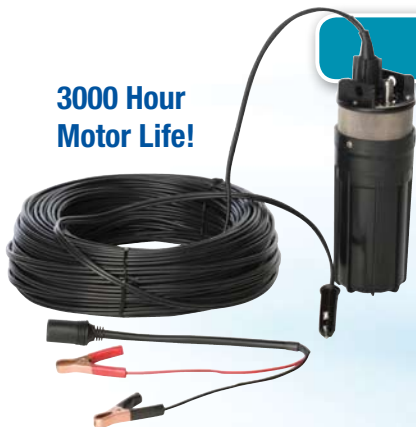
Item No. P-10380