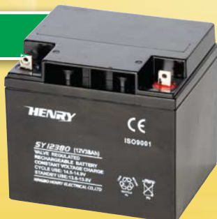
Item No. PB-16070