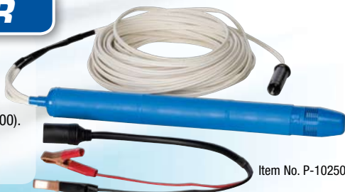
Item No. P-10250