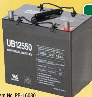
Item No. PB-16080