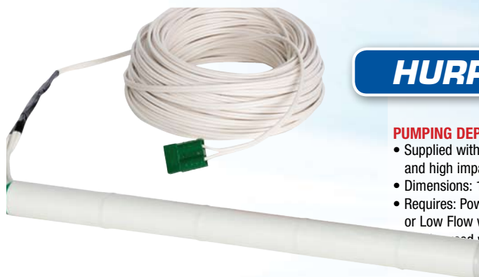
Item No. P-10510