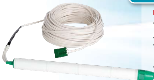
Item No. P-10500