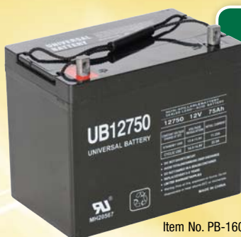
Item No. PB-16090

200% longer lasting than a standard 12 volt car battery