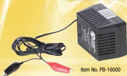
Item No. PB-16000