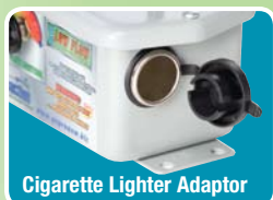
Cigarette Lighter Adaptor