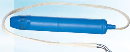
Item No. P-10010

NOT COMPATIBLE WITH ANY OF PROACTIVE'S CONTROLLERS.