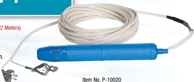
Item No. P-10020

NOT COMPATIBLE WITH ANY OF PROACTIVE'S CONTROLLERS.