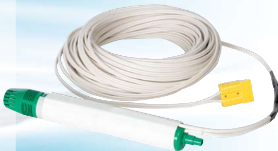
Item No. P-10350