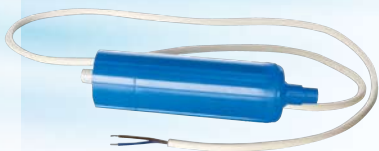
Item No. P-10000

NOT COMPATIBLE WITH ANY OF PROACTIVE'S CONTROLLERS