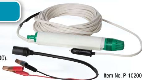
Item No. P-10200