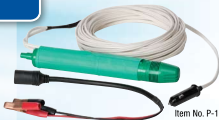
Item No. P-10150