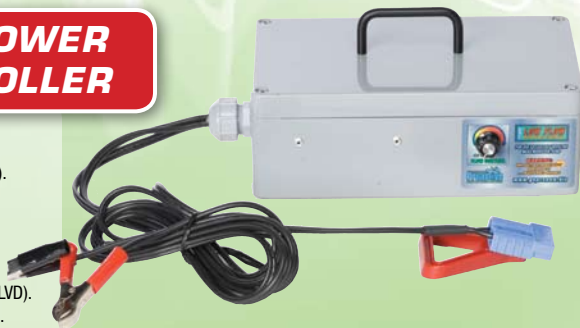
Item No. PA-10850